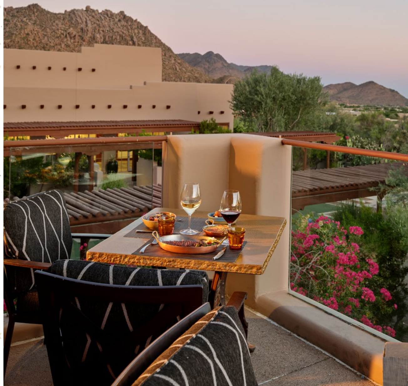
FOUR SEASONS RESORT SCOTTSDALE AT TROON NORTH