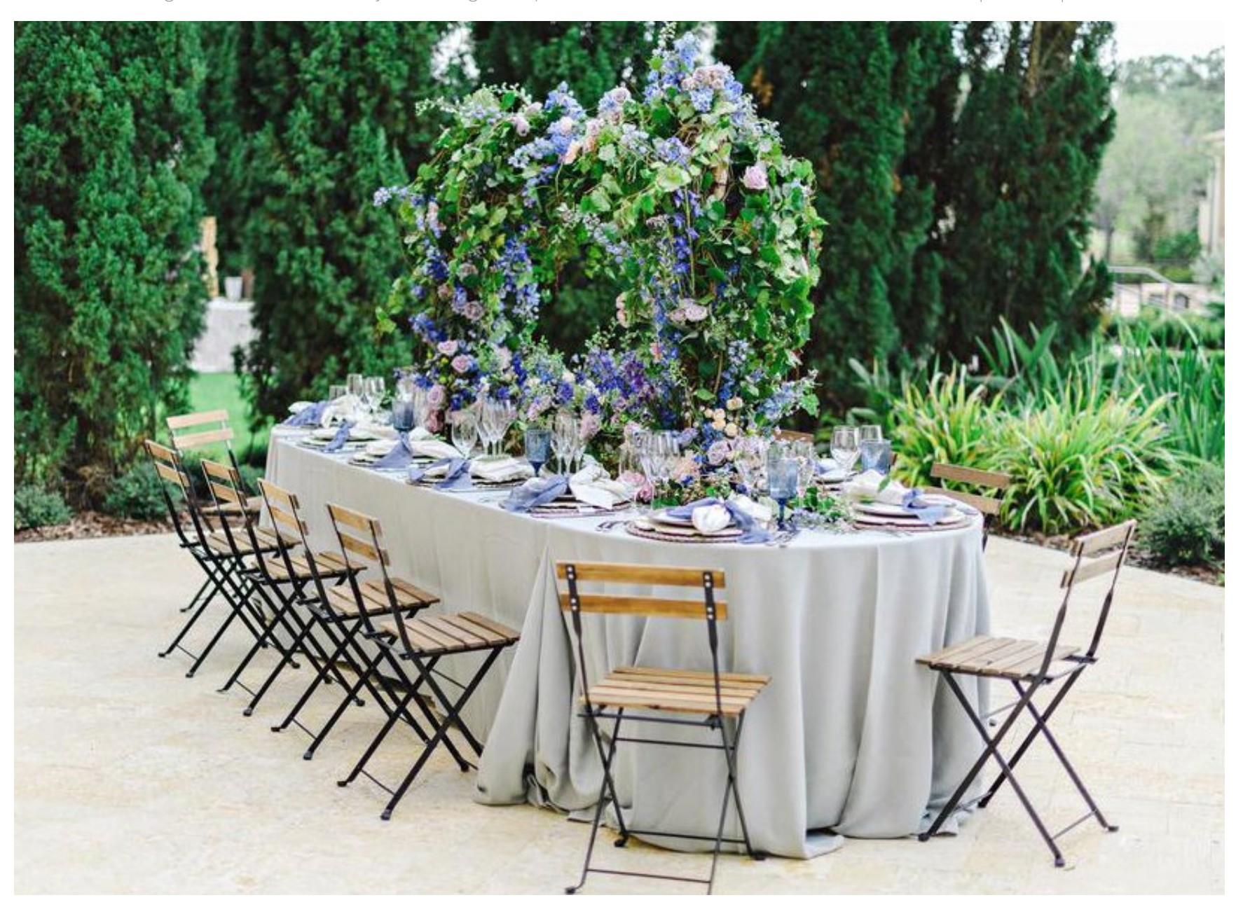
From bridesmaids' luncheons, to rehearsal dinners, to post-wedding brunches and more, revel in boundless celebration within a spectacular setting.

Packages: Intimate Ceremony, Wedding Reception, Cultural Celebrations, Additional Events | Menus | Details