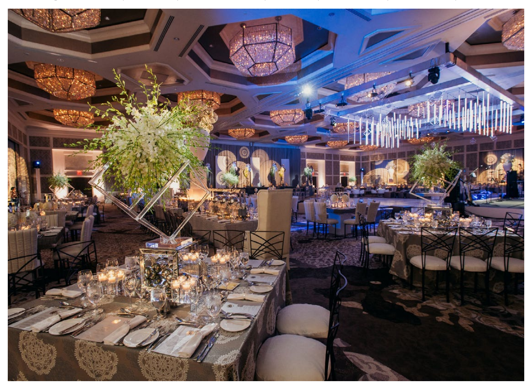
Four Seasons Resort Orlando offers a diverse array of indoor and outdoor wedding venues complete with spacious lawns and stunning ballrooms with ample natural light. The extraordinary event spaces paired with our signature Four Seasons service ensures your special event is nothing short of an unforgettable experience.