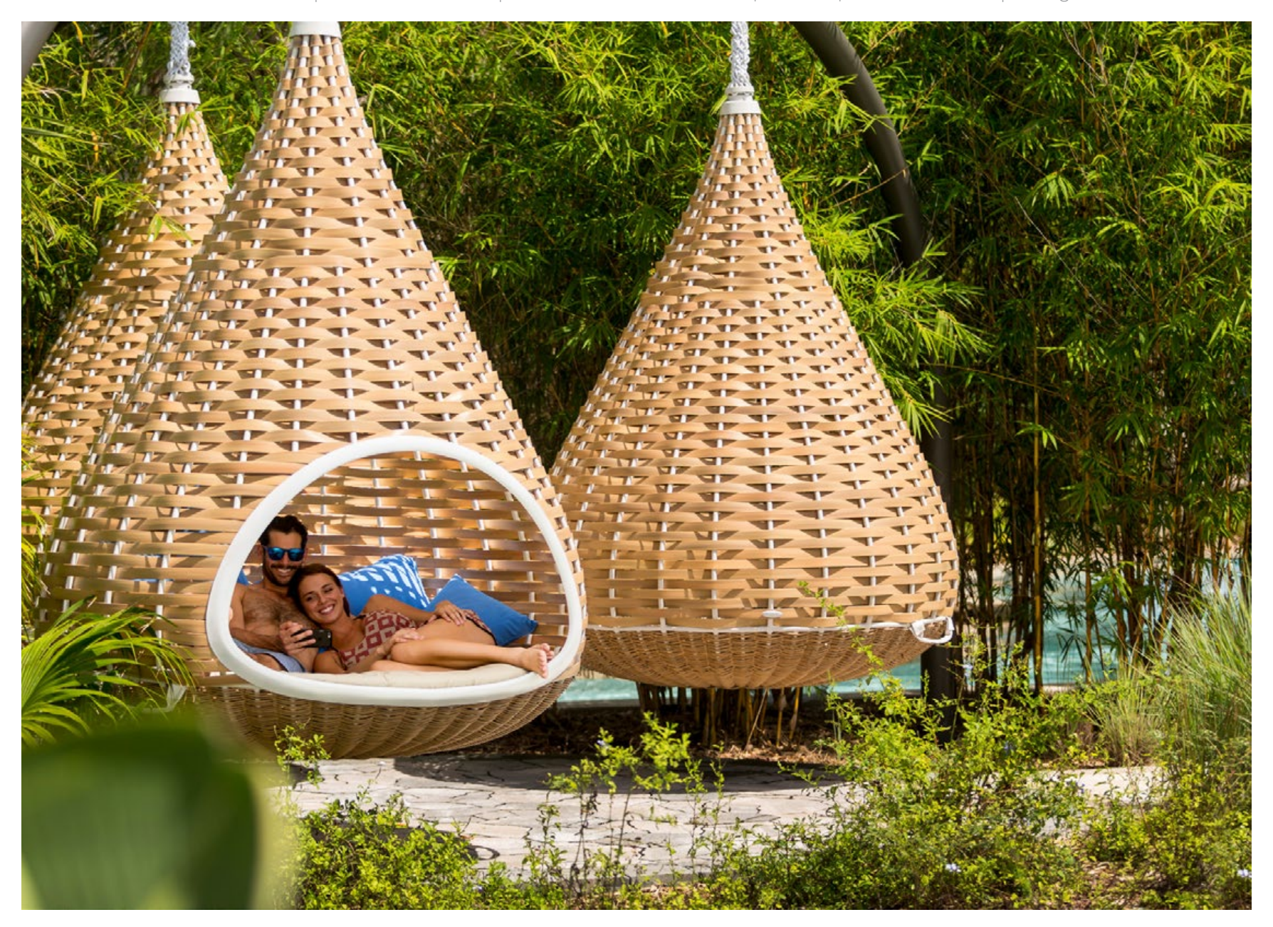
From pristine pools and spa facilities, to state-of-the-art golf and fitness programs, options abound for everyone's enjoyment. Every wedding guest is a VIP, even the youngest ones; Kids For All Seasons offers a complimentary camp for children ages 4 to 12.