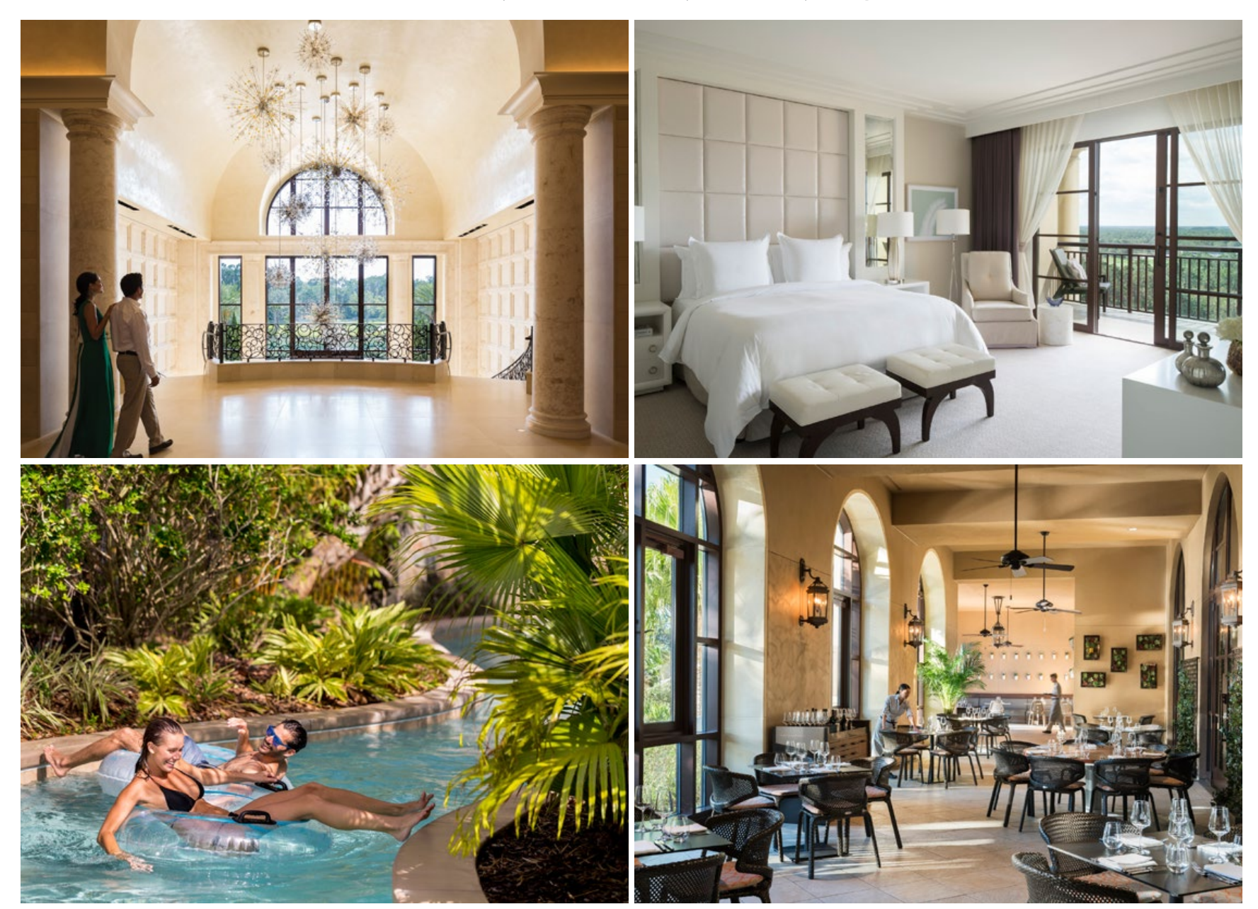
As Central Florida's only AAA Five Diamond resort, Four Seasons Resort Orlando is a dream come true wedding destination.