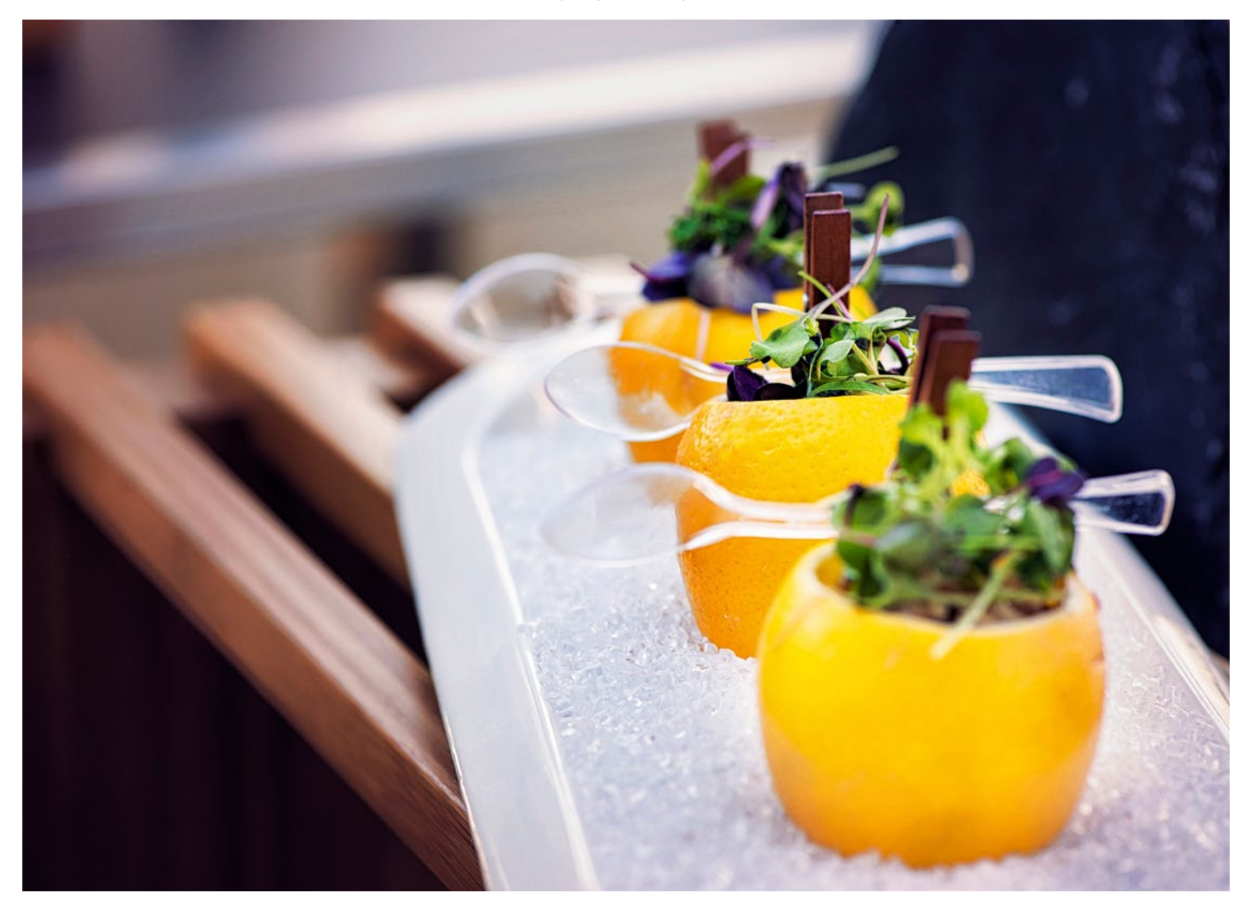
Whether you seek a plated multi-course dining experience, or an extravagant station set up with a variety of selections, our delicious food and beverage offerings ensure there is something to satisfy all palates.