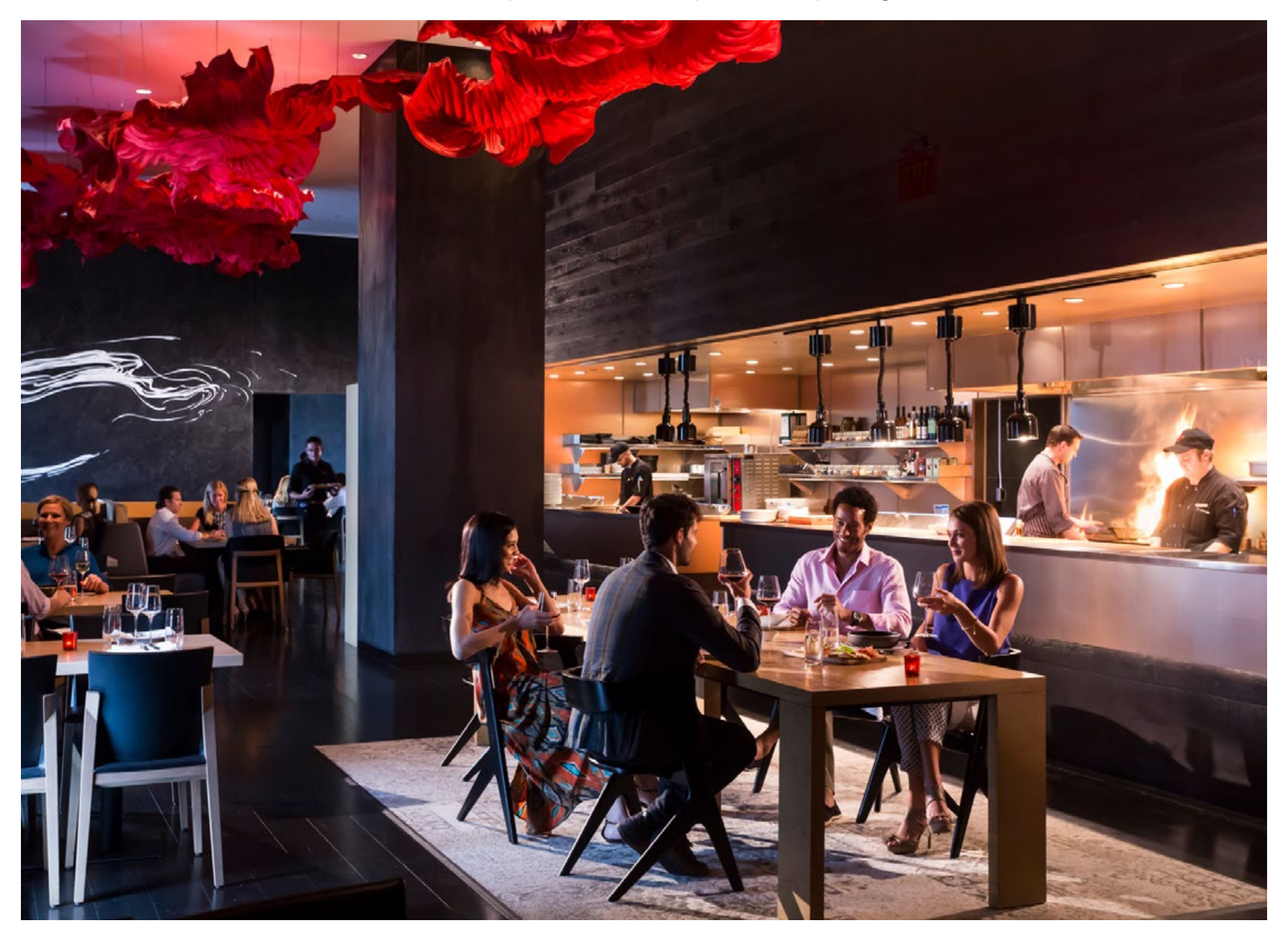
The resort offers six vibrant <u>restaurants</u> for your guests to enjoy as a group or on their own during their time with us. Exquisite private dining rooms in Capa and Ravello provide the perfect setting to enjoy rehearsal dinners with <u>customized menus</u>. For larger gatherings, Plancha and PB&G transform into fully private evening locations where couples can entertain in a restaurant-style setting.