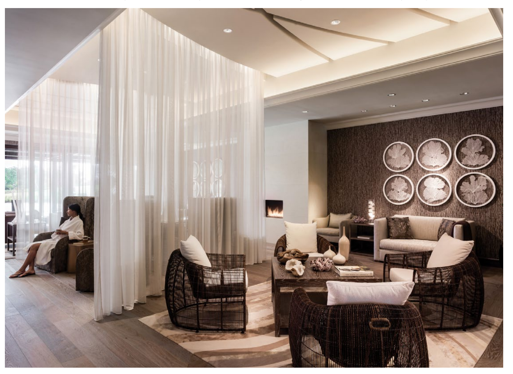
The Spa is an oasis of serenity offering a comprehensive collection of advanced aesthetic services, beautiful body therapies designed to help ensure you look and feel your best on your wedding day. Indoor and outdoor relaxation areas provide the perfect setting for an intimate and tranquil bridal party gathering. Expert hair and nail care await in the full service Salon.