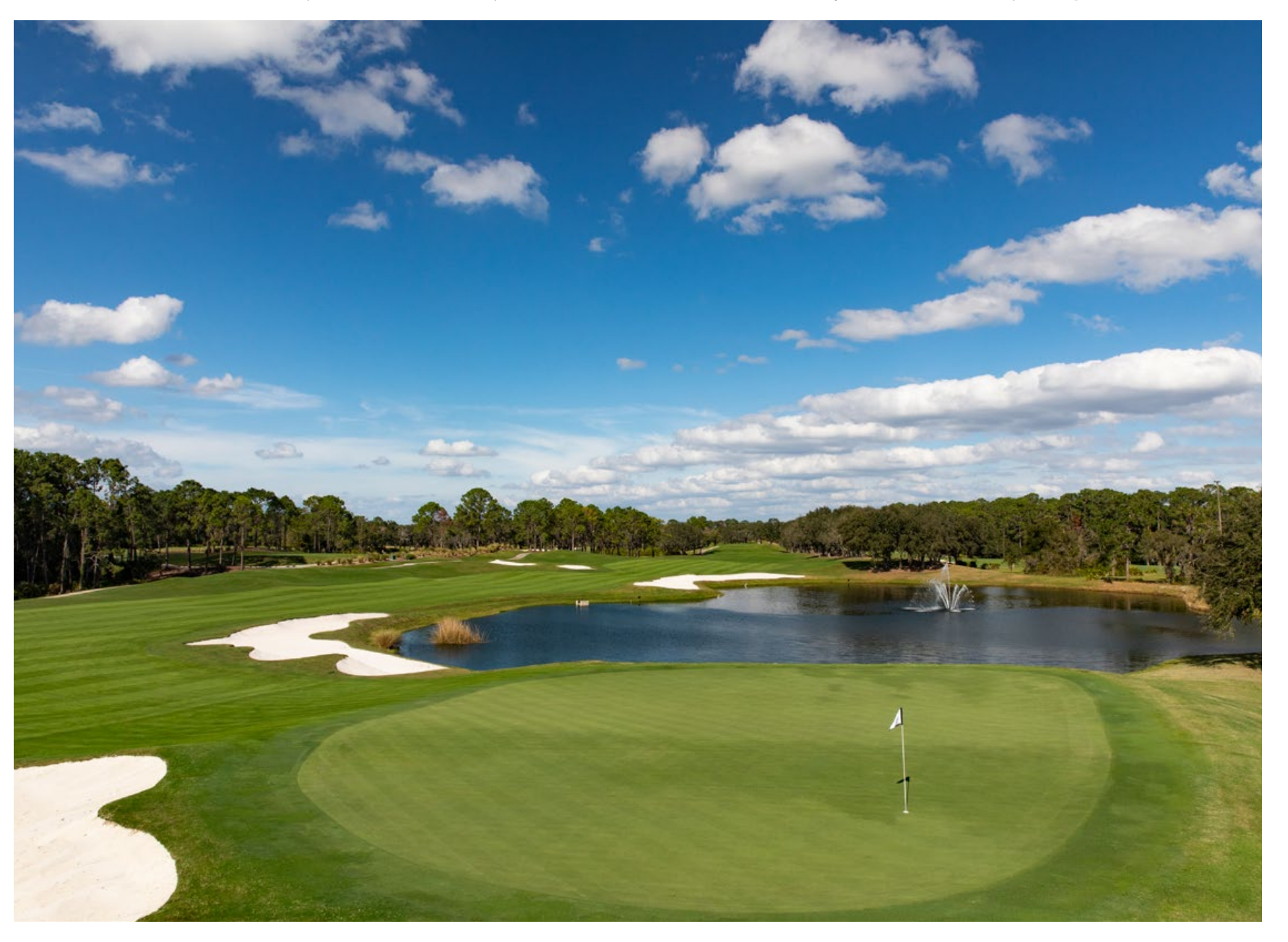
Escape into nature at Tranquilo Golf Course , a certified Audubon sanctuary home to abundant wildlife and protected wetlands. The Tom Fazio designed course offers wedding parties a picturesque layout to enjoy over your wedding weekend.