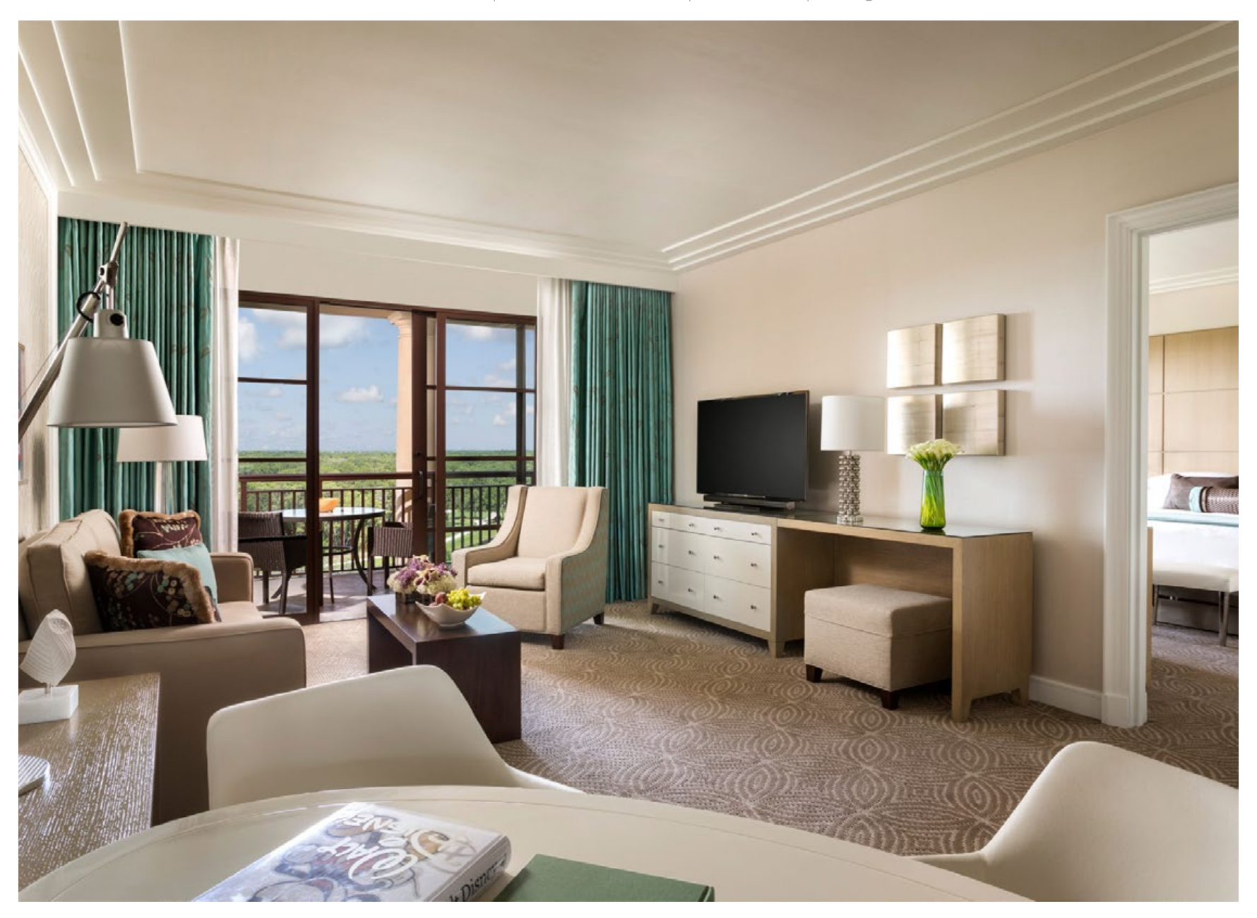
From the lounge chairs on your balcony, enjoy serene views of lush greenery or the Orlando skyline. Spacious and inviting, room and suite accommodations offer the ultimate comfort of your loved ones. Couples will enjoy unparalleled luxury with a complimentary overnight stay after saying "I Do".