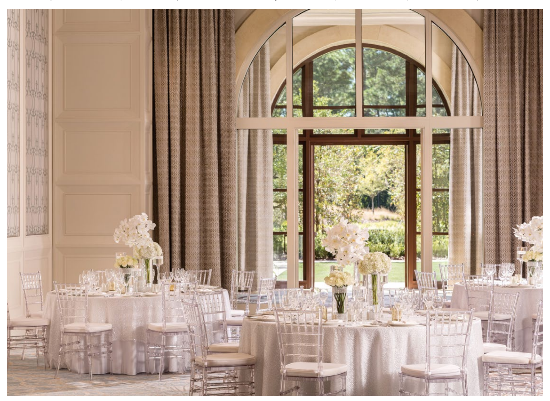
The Palm Ballroom offers 6,000 square feet of gorgeous event space elegantly appointed in neutral shades, allowing a perfect backdrop to feature the color palette of your choice. The conveniently situated Lady Palm Lawn allows for a seamless transition to an open-skied event.