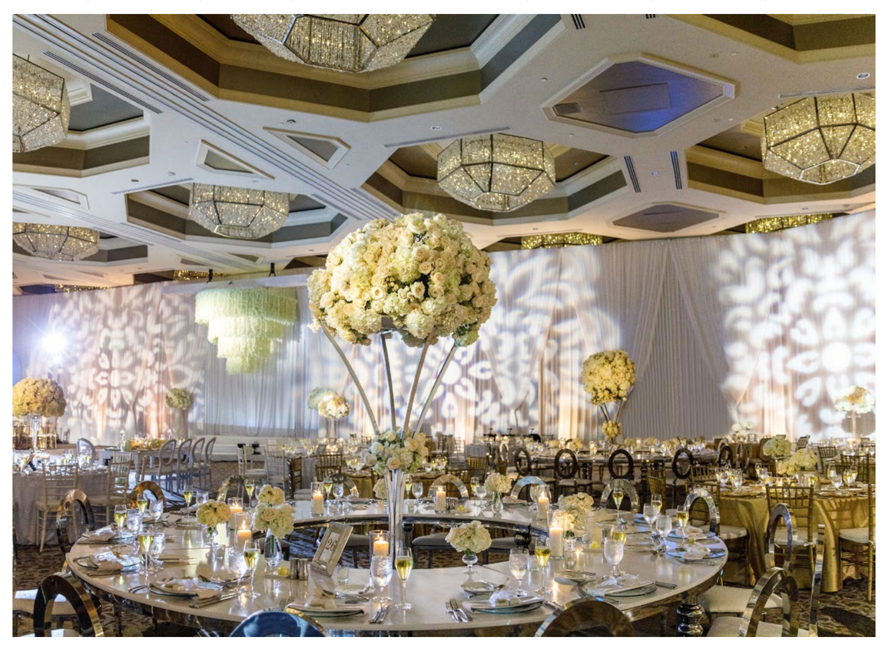
Breathtaking chandeliers and soaring ceilings set the stage for a spectacular celebration. The Grand Ballroom provides 14,000 square feet of impeccably designed space. Take in gorgeous views of the resort event lawns from the private balcony, ideal for a scenic cocktail reception.