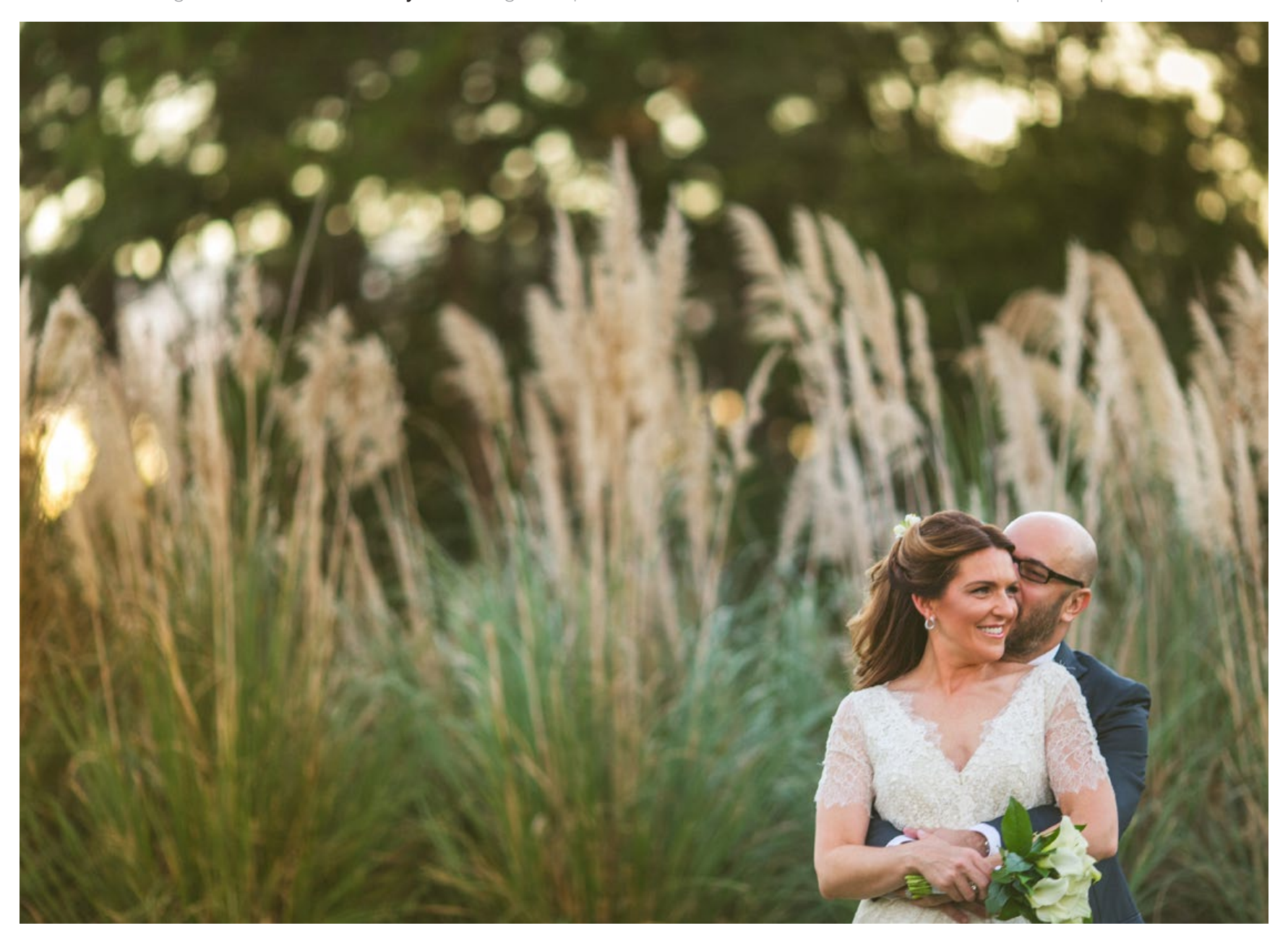
Celebrate your special day in a quaint lakeside setting with our <u>Intimate Ceremony Package</u>, ideal for up to 35 guests. Continue the festivities with your closest friends and family with a lavish reception or in an elegant private dining room.

Packages: Intimate Ceremony, Wedding Reception, Cultural Celebrations, Additional Events | Menus | Details