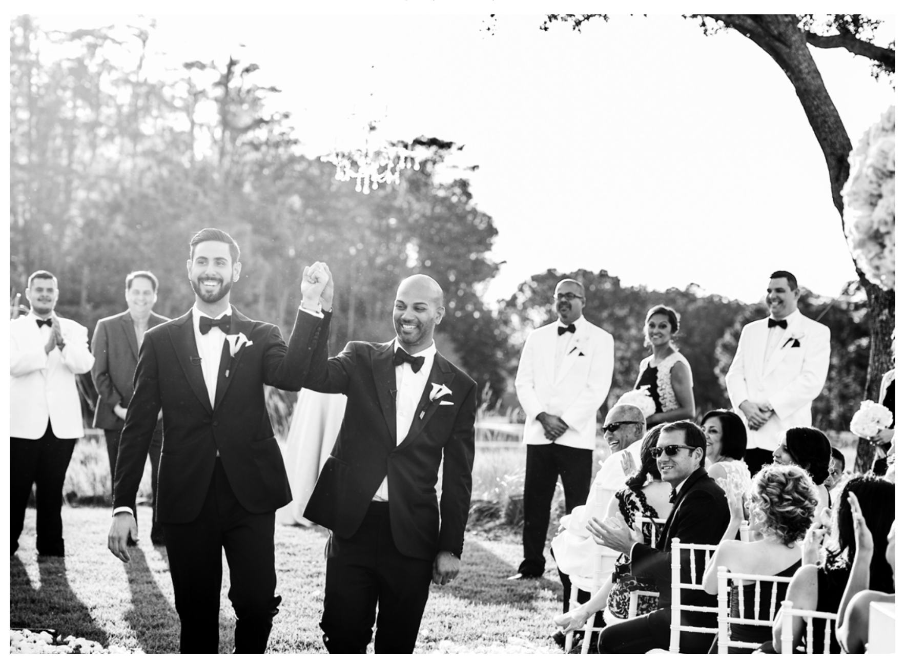
From fabulous pre-wedding celebrations to memorable farewells, hors d'oeuvres to wedding cakes, trust Four Seasons to simplify your planning and make your wedding experience everything you have ever imagined.