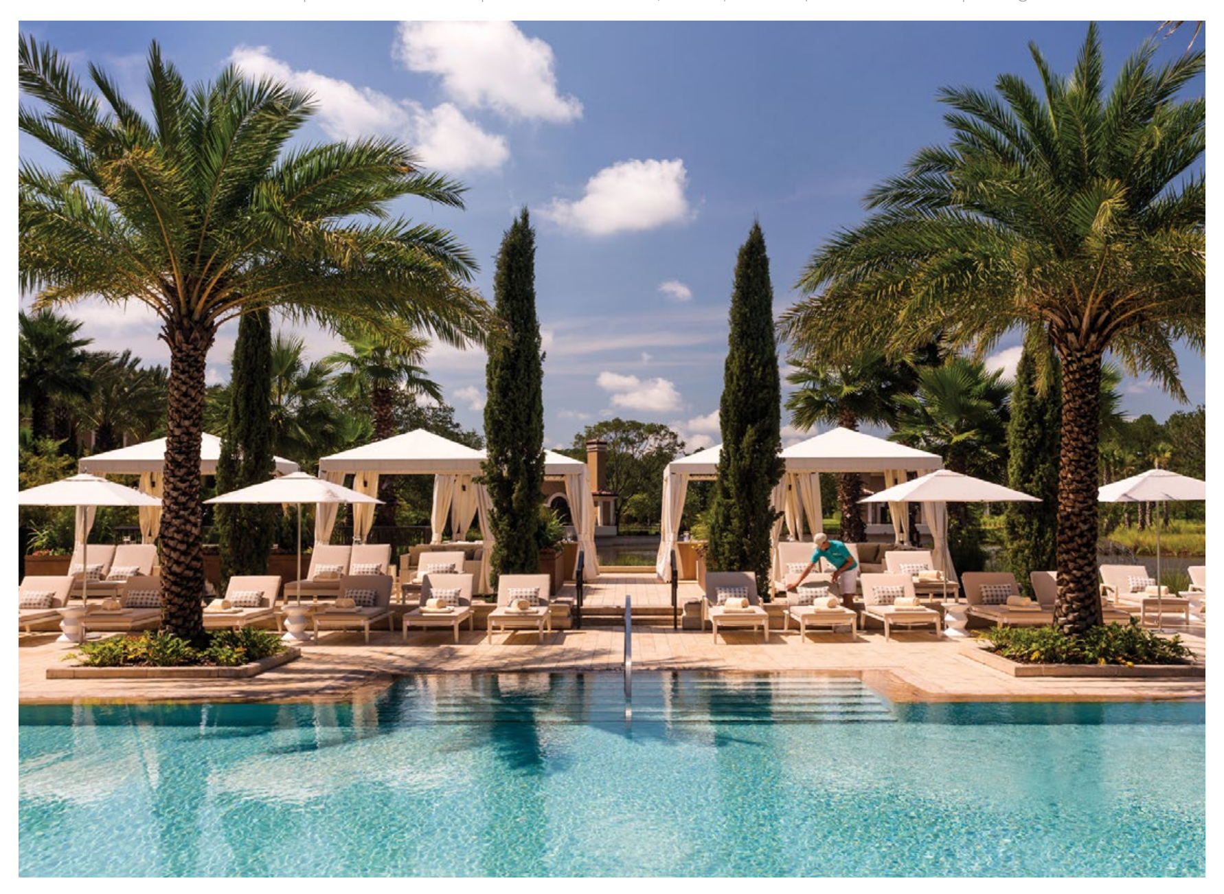
Unwind with your wedding party at Oasis, our luxurious adult-only pool, equipped with underwater audio. Explorer Island, our 5-acre water park, offers fun for all ages with a winding lazy river, an interactive Splash Zone, two exhilarating water slides, an expansive family pool and more.