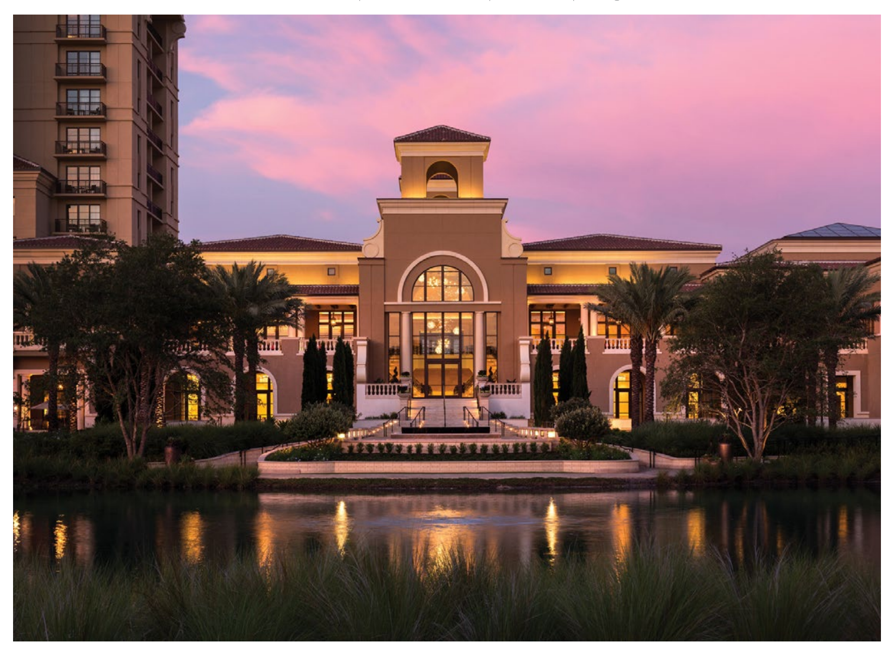
Our 26-acre lakeside haven is dotted with gardens, pools and towering palms. Just minutes away from the Disney Parks, the resort offers your perfect blend of Four Seasons experiences and Disney offerings. Family and friends will enjoy endless fun and relaxation while celebrating your special day.