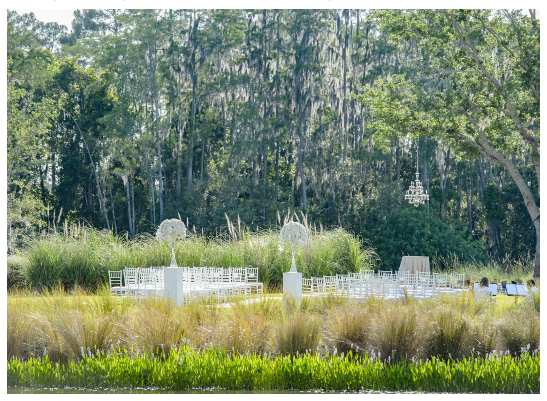
Lush Florida woodlands surrounding a lakeside enclave at Areca Lawn creates an elegant space ideal for an intimate celebration in a serene and natural setting.