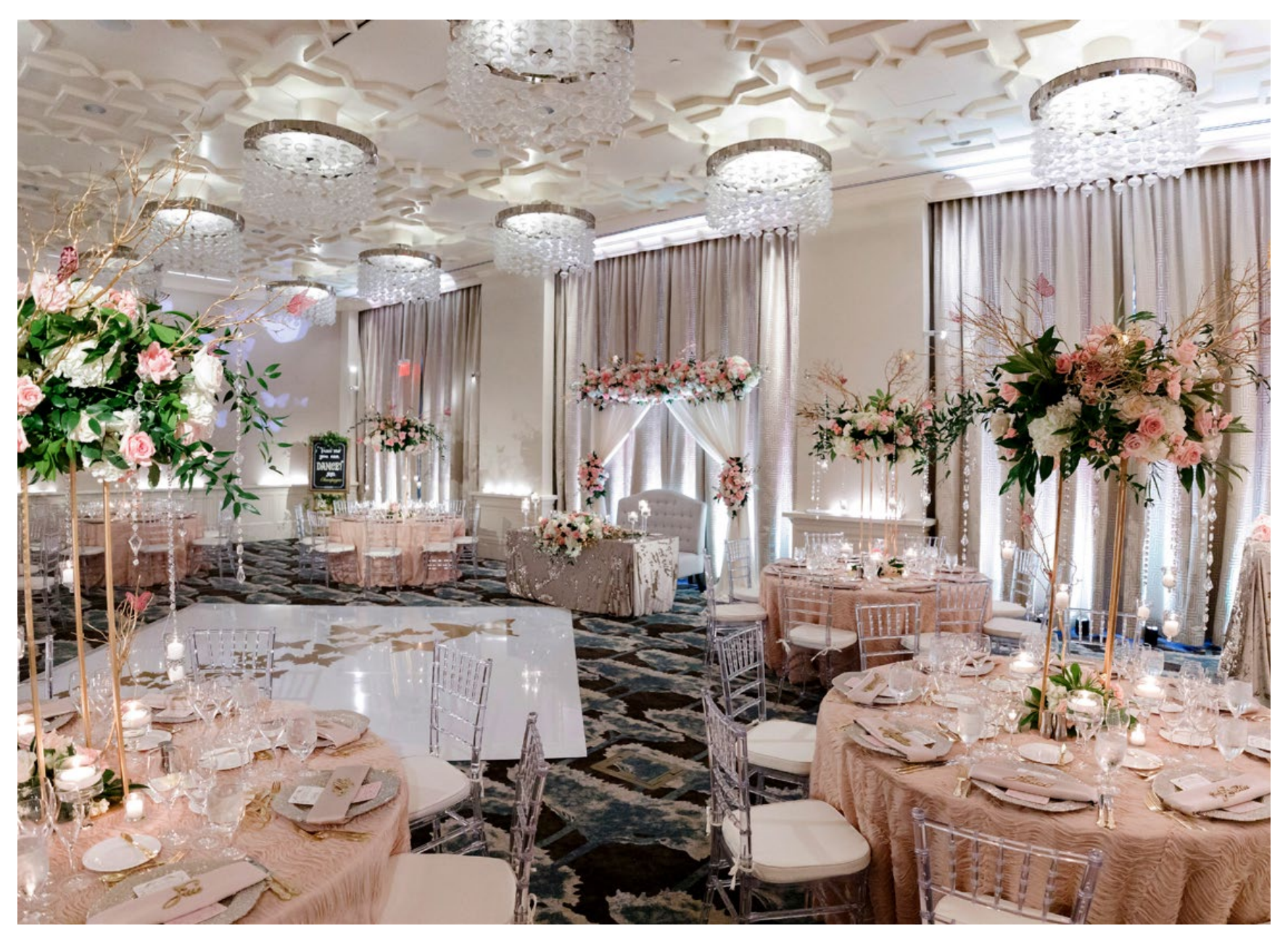
Inviting and contemporary, the Queen and Sabal Ballrooms each offer 1,500 square feet of beautiful event space. Infuse natural scenery into your celebration with the adjoining lakeside terrace and lawn.