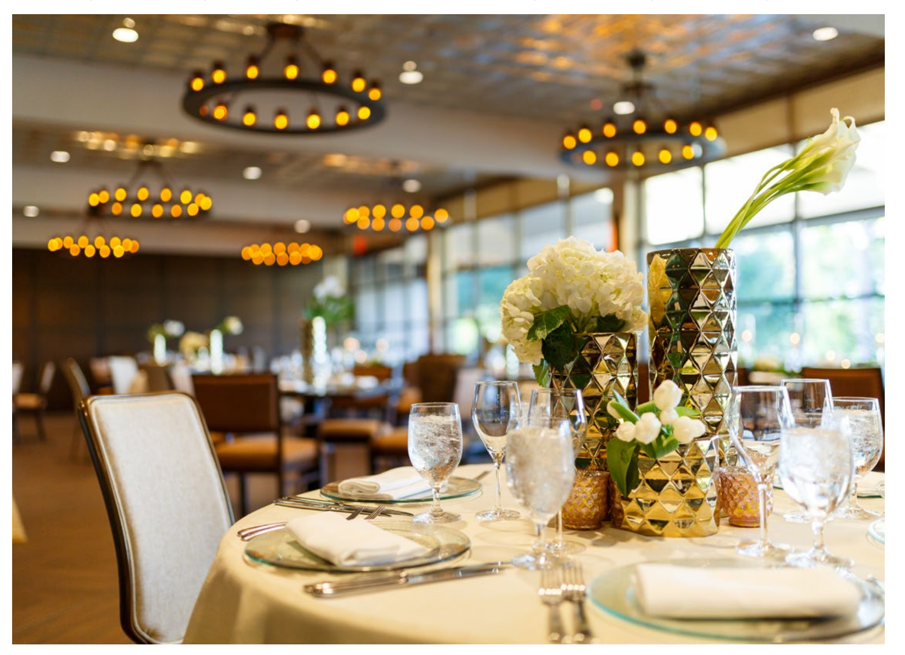
Located at Four Seasons Golf and Sports Club Orlando clubhouse, just a short scenic stroll away from the resort, Plancha provides the perfect restaurant-style setting with gorgeous resort views where couples can entertain for pre and post wedding affairs.