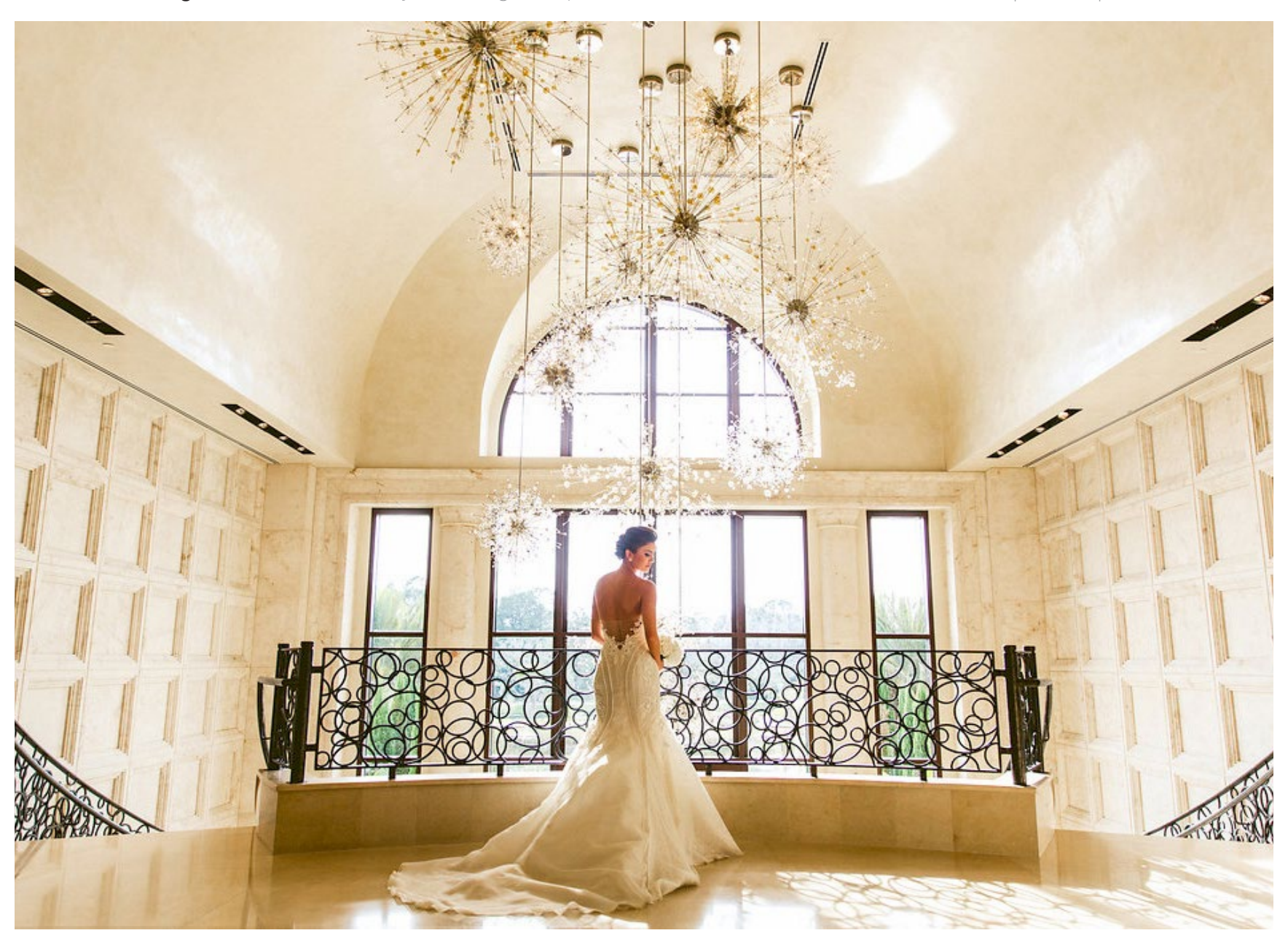
Our curated wedding packages ease the planning process and serve as inspiration for your custom-designed occasion. Our wedding specialists will offer expert guidance - allowing you to anticipate your wedding day with excitement and confidence.

Packages: Intimate Ceremony, Wedding Reception, Cultural Celebrations, Additional Events | Menus | Details