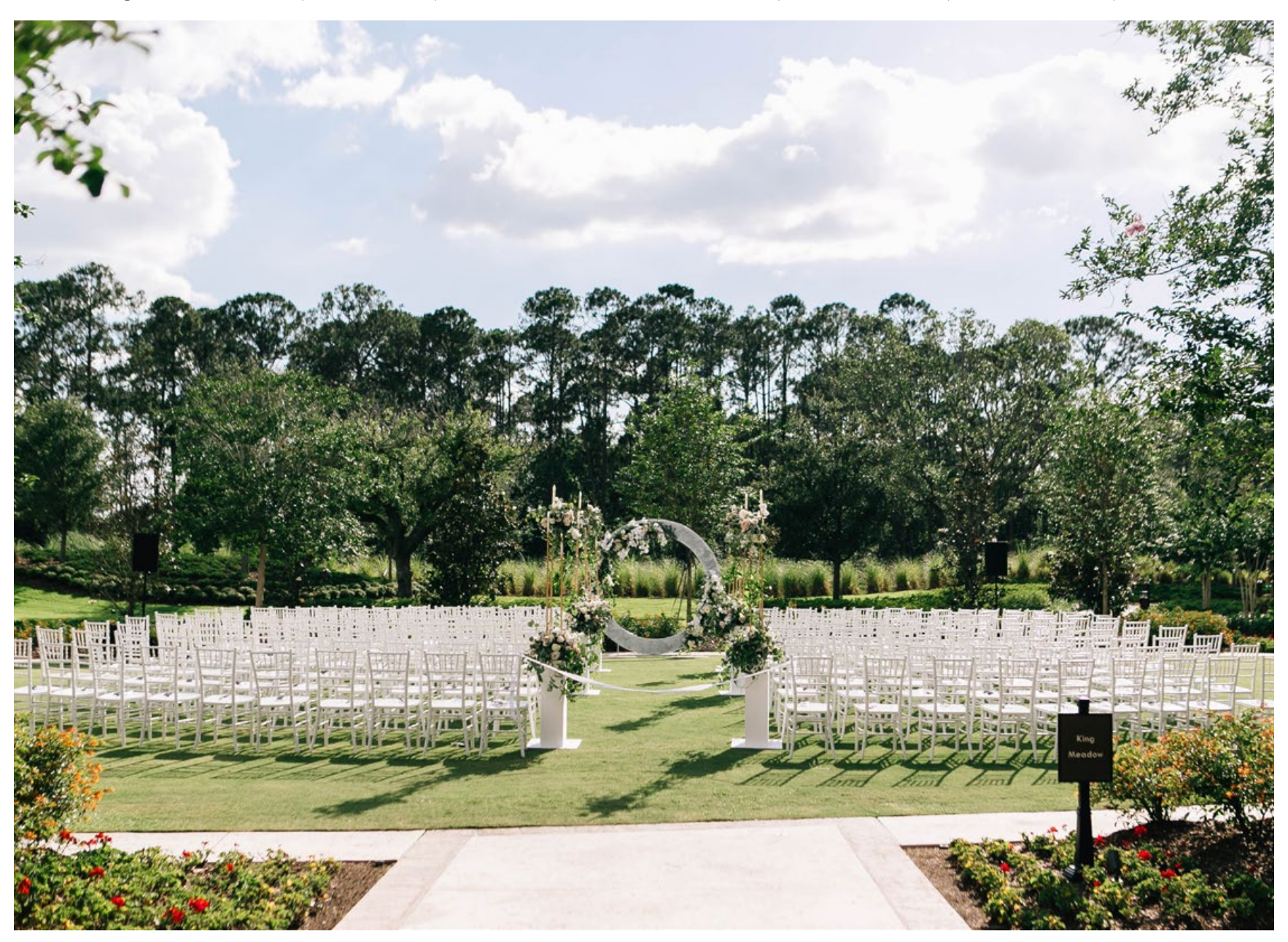
The landscaped grounds of the spacious King Meadow Lawn are accented with abundant flora and greenery, creating a beautiful backdrop for vows or a pre-event cocktail reception.