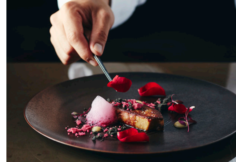
Exquisite dining experiences