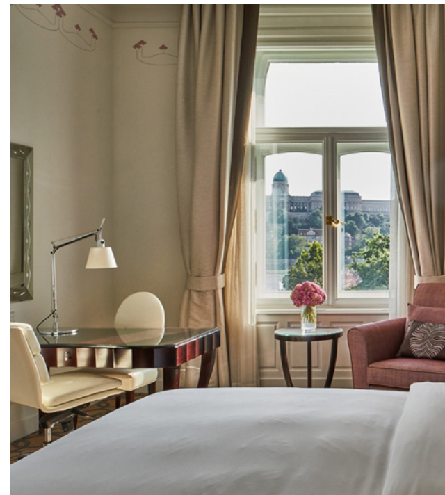
Four Seasons Hotel Gresham Palace Budapest