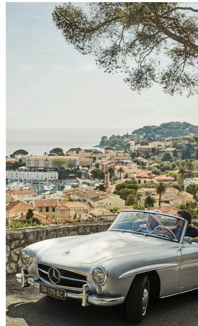
Vintage car ride to Monte-Carlo

Farewell doesn't have to mean goodbye—at least not yet. Opt to extend your journey to spend some time exploring the best of the French Riviera before embarking on your flight home.