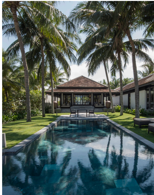
Four Seasons Resort The Nam Hai, Hoi An

Savour each moment while we handle the rest. The Four Seasons Private Jet Experience offers you the chance to discover a stunning range of destinations with the comfort of Four Seasons service every step of the way. Our team of dedicated professionals includes an Onboard Concierge, Executive Chef and flight crew equipped with proprietary Four Seasons service training, as well as a trip physician who attends to any health needs you may have. We'll see to it that all the details and logistics of your journey are taken care of, allowing you to focus on the joys of an adventure that you could only get with Four Seasons.