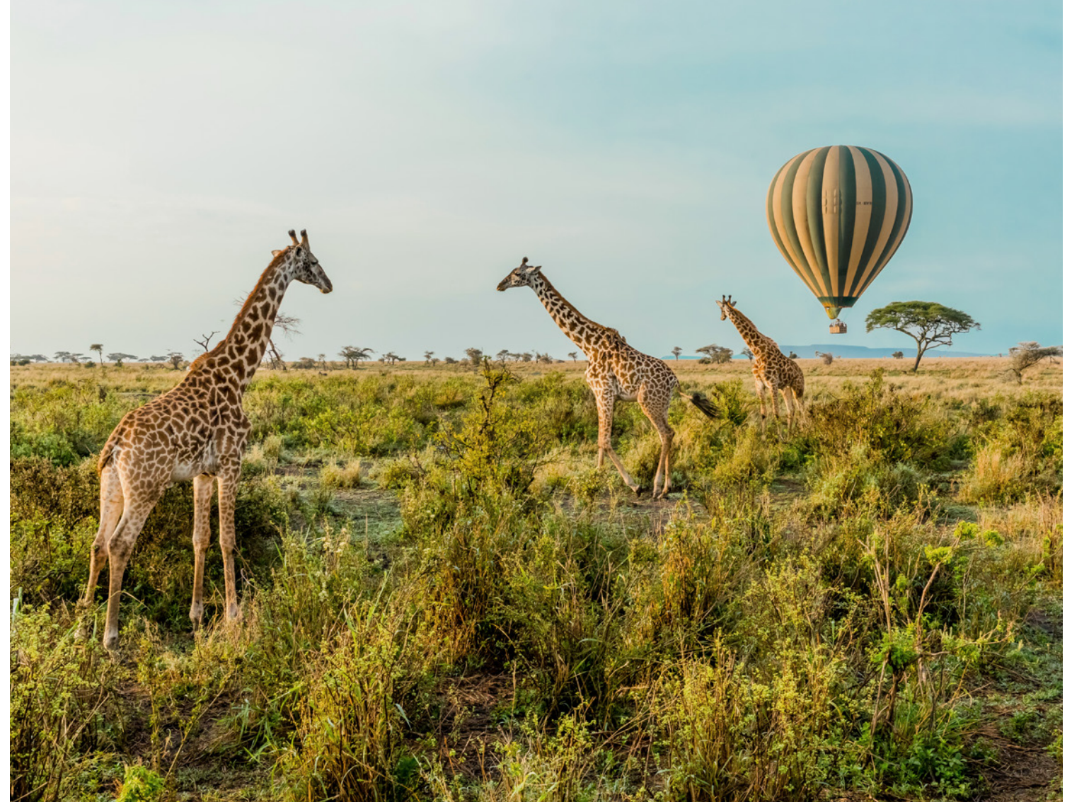
Hot-air balloon ride