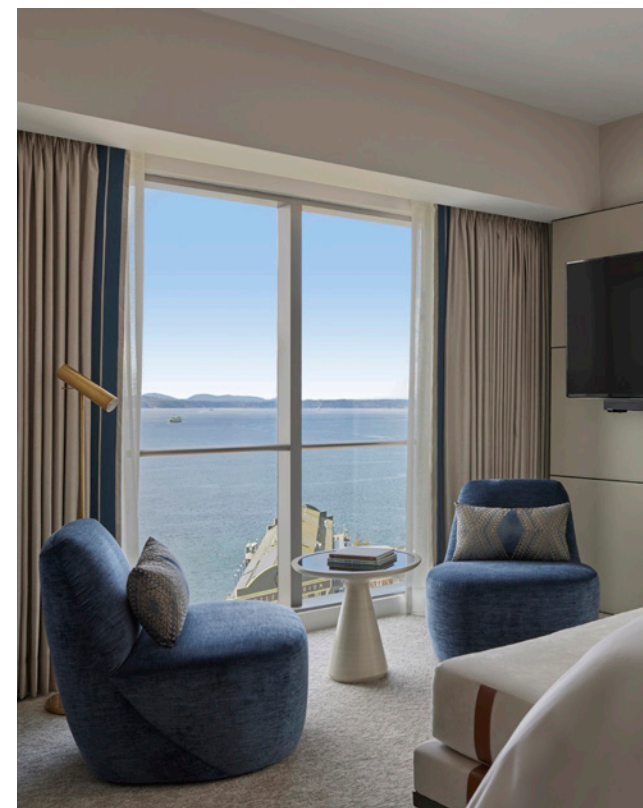
Dramatic Elliott Bay views from Four Seasons Hotel Seattle