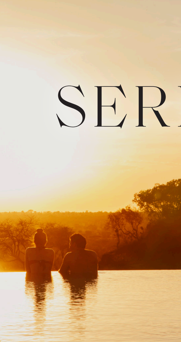
Infinity pool overlooking an elephant watering hole

Your journey through the world's most pristine landscapes continues in Serengeti National Park, where you are surrounded by the beauty of the land and its wild inhabitants. Your safari begins the moment you arrive, with a game drive to our lodge. Over the next three nights, choose from half-day or all-day game drives that bring you up close to Africa's largest and most diverse concentration of wildlife.