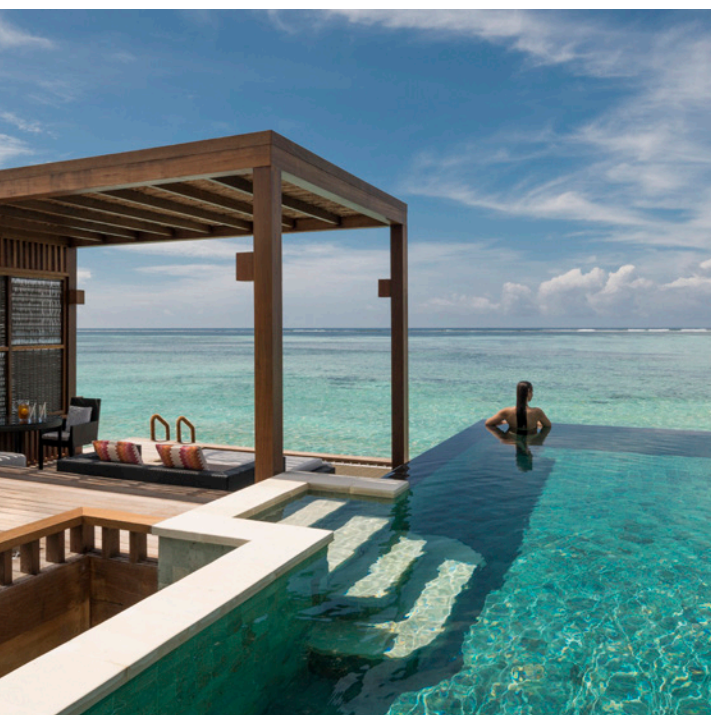
Plunge pool, Four Seasons Resort Maldives at Kuda Huraa