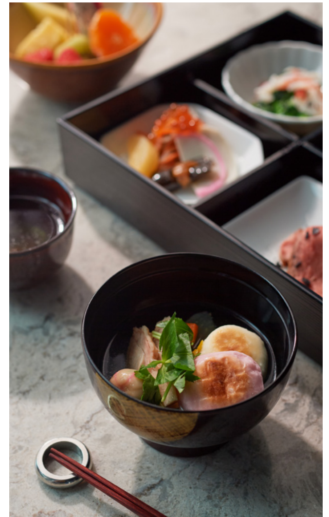
Culinary delights abound.

Visit Tokyo's famed Tsukiji outer market with a Michelin-distinguished chef to source fresh, seasonal ingredients for a cooking class. Learn the secrets of preparing and presenting different Japanese dishes under the guidance of your chef, enjoying the fruits of your labour and a sake tasting.