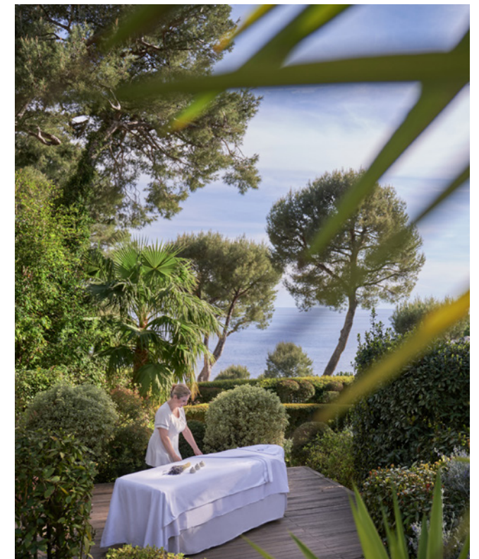
Outdoor spa service, Grand-Hôtel du Cap-Ferrat

Immerse yourself in culinary mastery with a curated mix of dining experiences from special-event group dinners with your fellow travellers to opportunities to dine at local restaurants on your own. Our Onboard Concierge is always on hand to personalise each experience for you, whether providing restaurant recommendations, making dinner reservations, or ensuring your morning coffee is prepared just the way you like it.