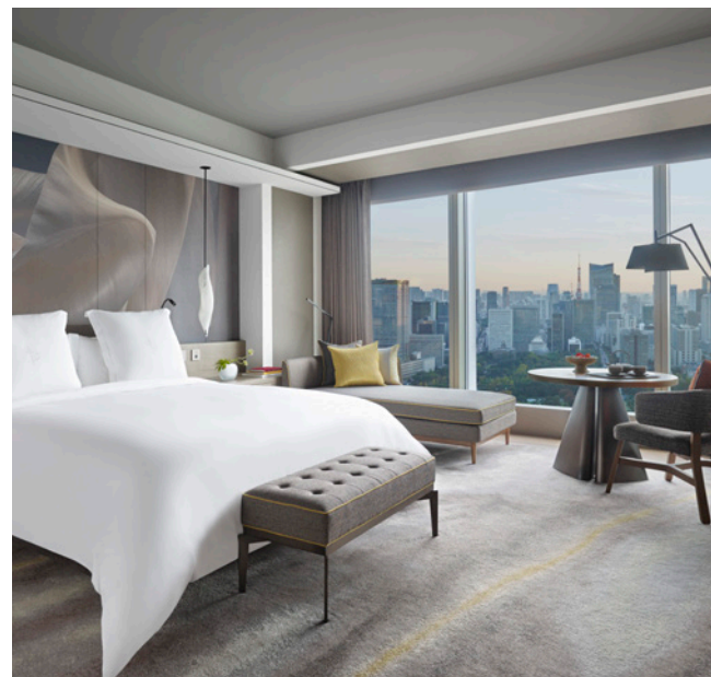
Sweeping city views from the room

Your adventure begins in Japan's eclectic metropolitan capital, a city of contrasts where ancient temples and age-old markets stand alongside modern high-rises and a sparkling skyline.