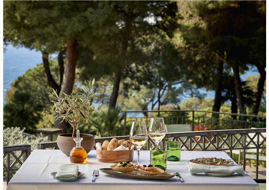
Enjoy our butler service and privileged access to all hotel services.