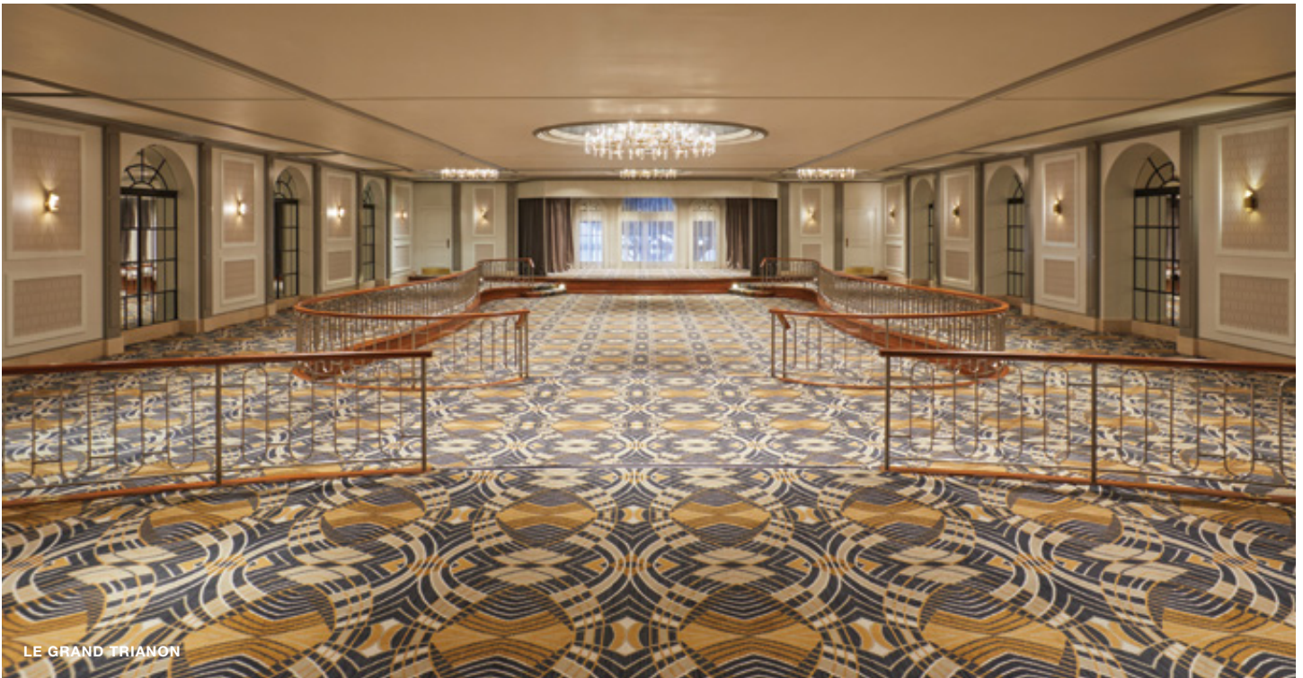
LE GRAND TRIANON